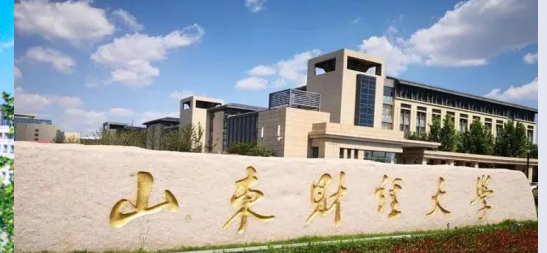
Shandong University of Finance and Economics