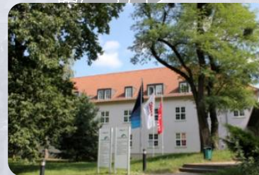
Dresden - Jinan Contact Office Germany, Dresden