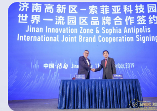
JIZ - Sophia Antipolis Strategic Cooperation France, Sophia Antipolis