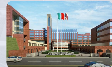
Jinan Thomas International School