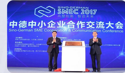
Sino-German (European) SME Communication & Cooperation Conference China, Jinan