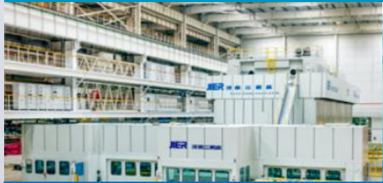
Jier Machine Tool Group