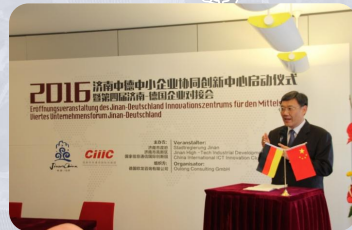
Jinan SME Collaborative Innovation Center Germany, Stuttgart