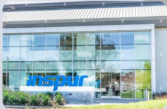
Inspur Innovation and Research Center USA, Silicon Valley