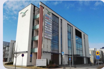
CIIC Jinan – Vantaa Office Finland, Helsinki