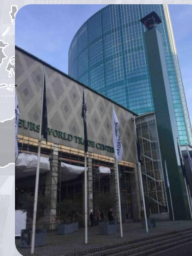
The Jinan – Europe Representative Office Netherlands, Rotterdam