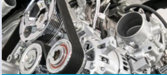
Shandong Heavy Industry Group